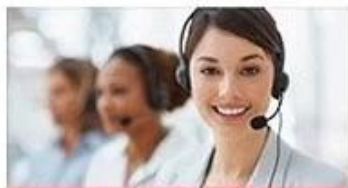
send us inquiry