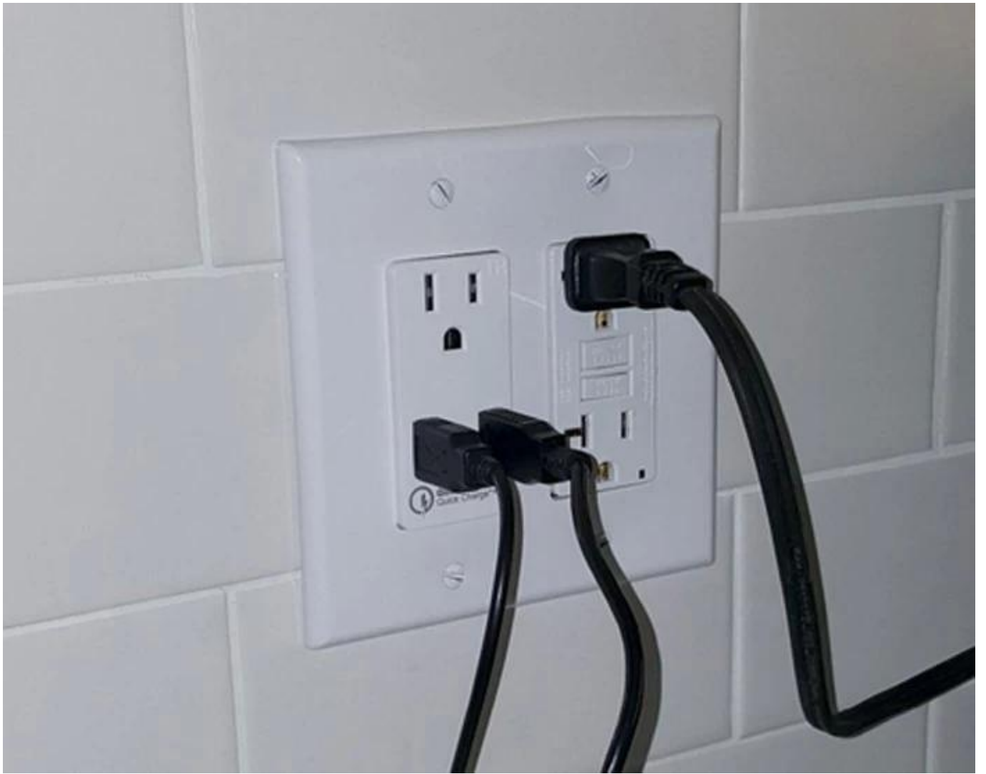
USB Type C Wall Plate USB Charger