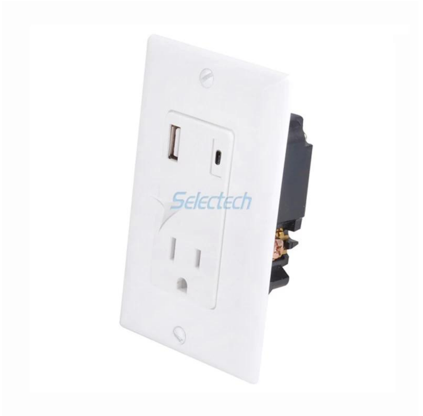
USB wall socket charger