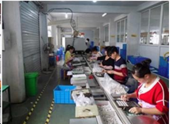
Smart USB Wall Charger factory