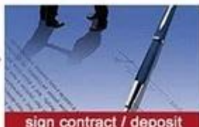
sign contract / deposit