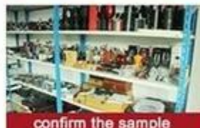
confirm the sample