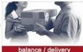
balance / delivery