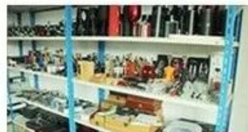
confirm the sample