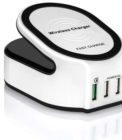
Wireless Charger Support brand: Samsung, Nokia, HTC, Google, LG, Sony, Moto