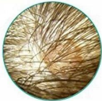
Hair quality check