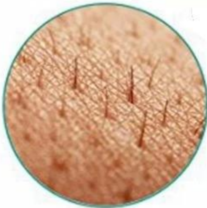
Hair follicles to check