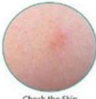
Check the Skin