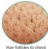
Hair follicles to check