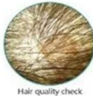
Hair quality check