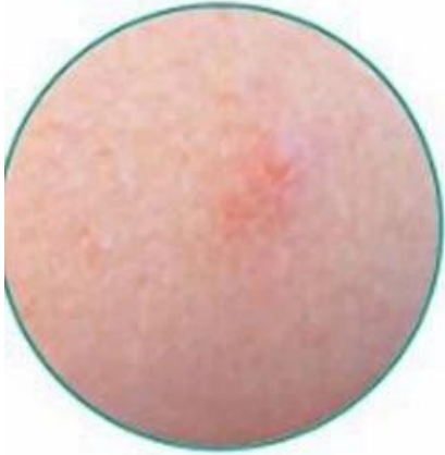
Check the Skin