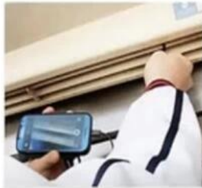
AIR CONDITIONER INSPECTION