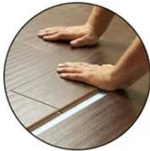
Floor level measurement