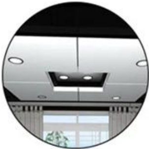
Ceiling level measurement