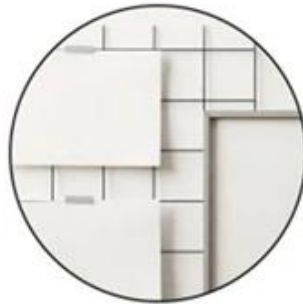
Wall tile angle measurement