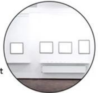
Decoration level measurement