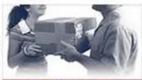
balance / delivery