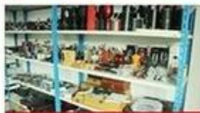
confirm the sample