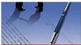
sign contract / deposit