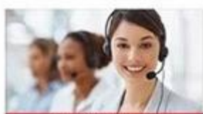
send us inquiry