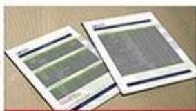
receive our quotation