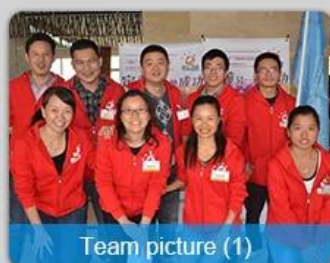
Team picture (1)