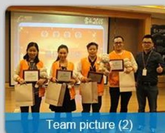
Team picture (2)