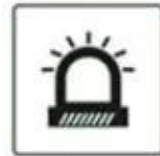
High temperature alarm