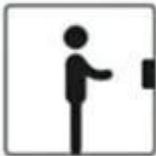
No labor required