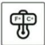
Dual temperature mode