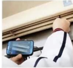
AIR CONDITIONER INSPECTION