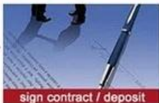
sign contract / deposit