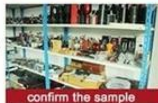
confirm the sample