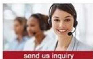
send us inquiry