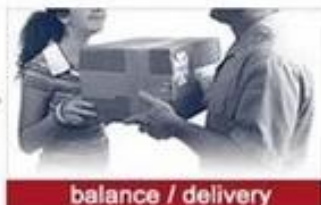
balance / delivery