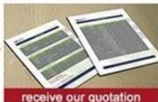
receive our quotation