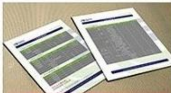
receive our quotation