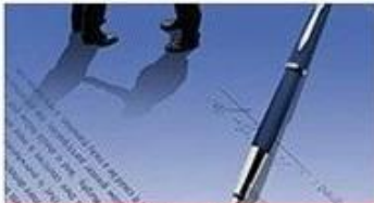
sign contract / deposit