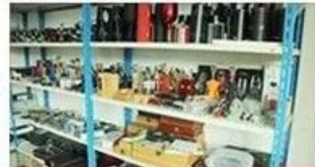
confirm the sample