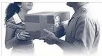
balance / delivery