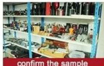
confirm the sample