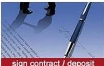
sign contract / deposit