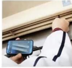
AIR CONDITIONER INSPECTION