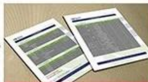
receive our quotation