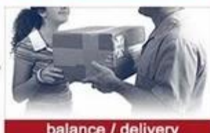
balance / delivery