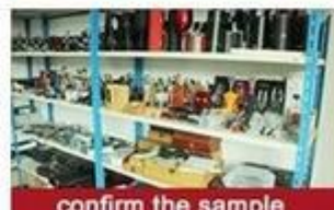
confirm the sample