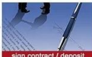
sign contract / deposit