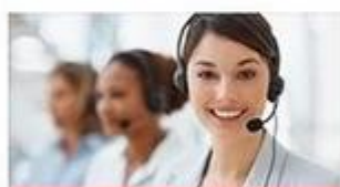
send us inquiry