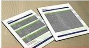
receive our quotation