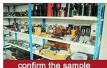
confirm the sample