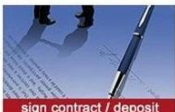
sign contract / deposit