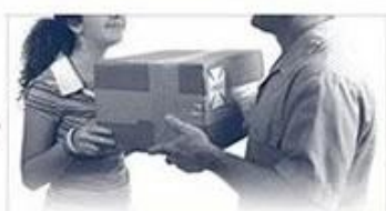
balance / delivery