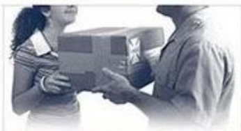
balance / delivery