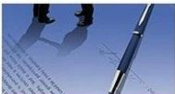
sign contract / deposit