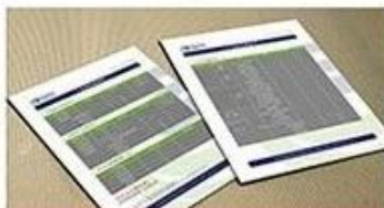
receive our quotation