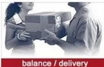
balance / delivery