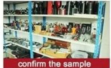
confirm the sample