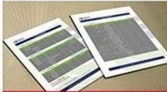
receive our quotation