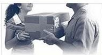
balance / delivery