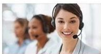
send us inquiry