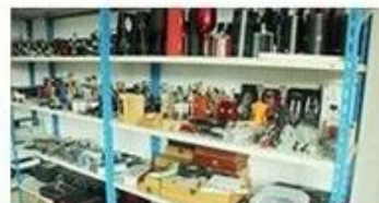
confirm the sample