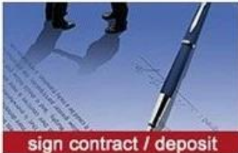
sign contract / deposit