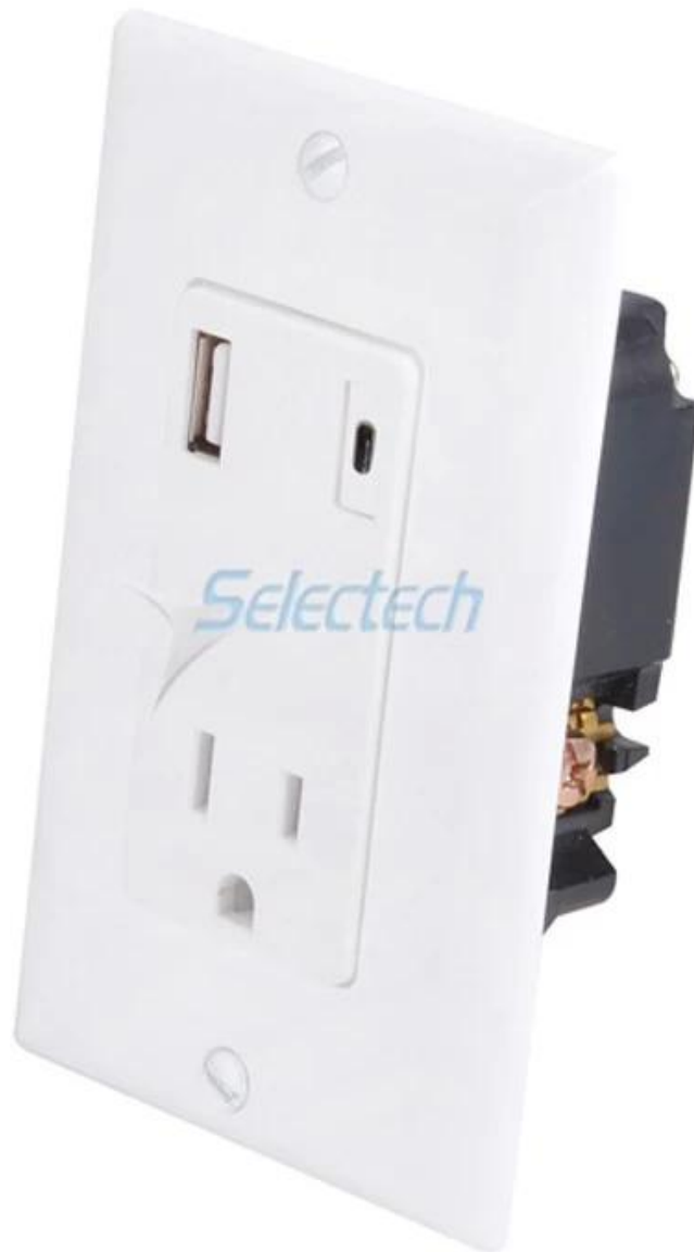
USB wall socket charger