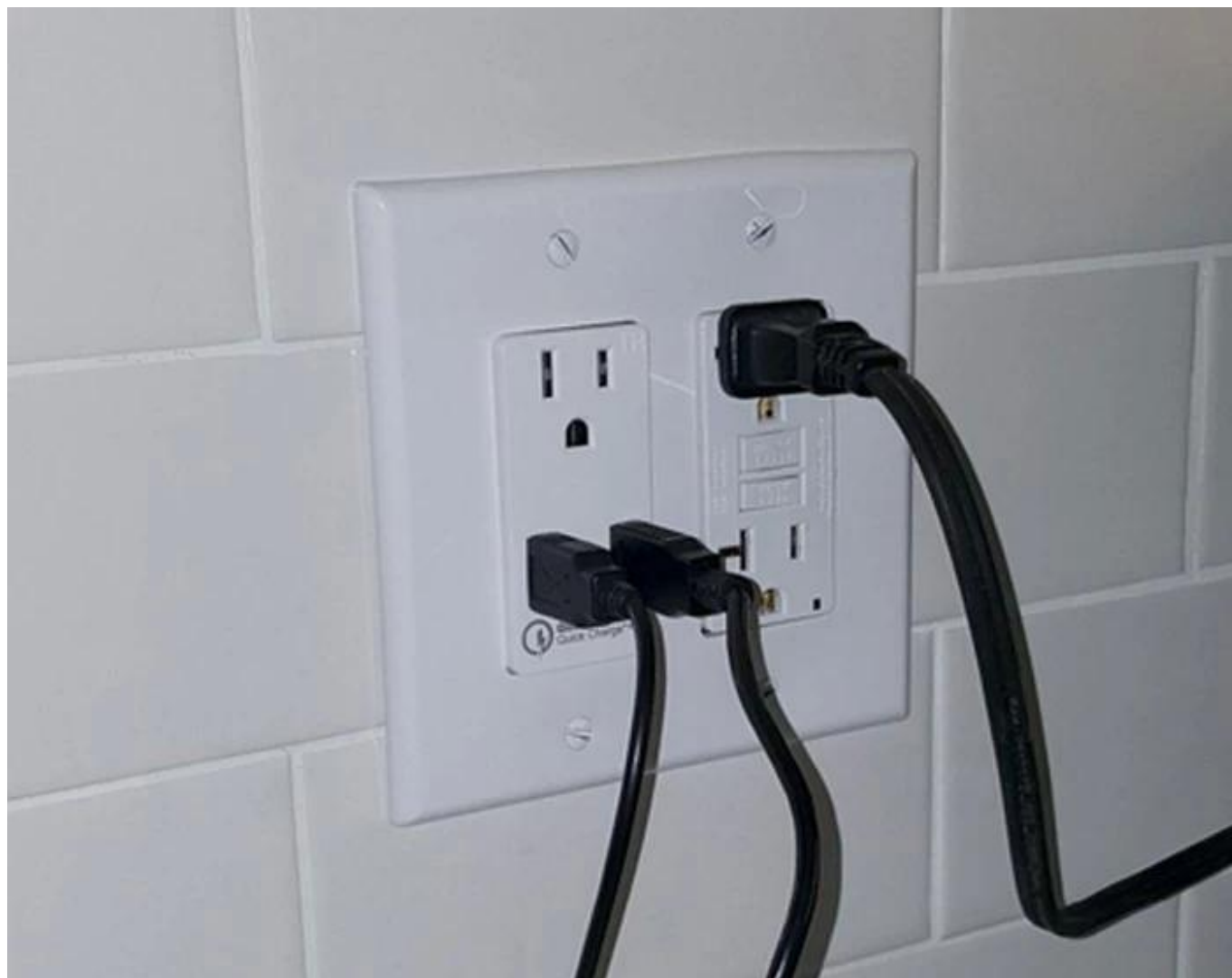
USB Type C Wall Plate USB Charger