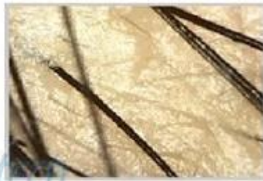
Skin & Hair