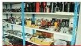
confirm the sample