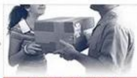
balance / delivery