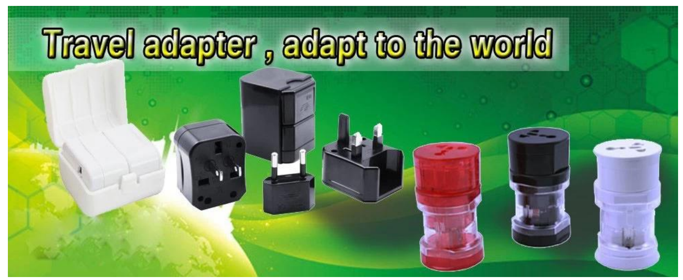
China Shenzhen Factory Travel Adaptor Euro To UK 3 Pin 13A Plug SE-ECP