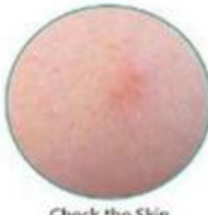
Check the Skin