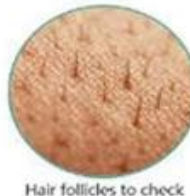
Hair follicles to check