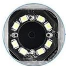
8 LED Lights