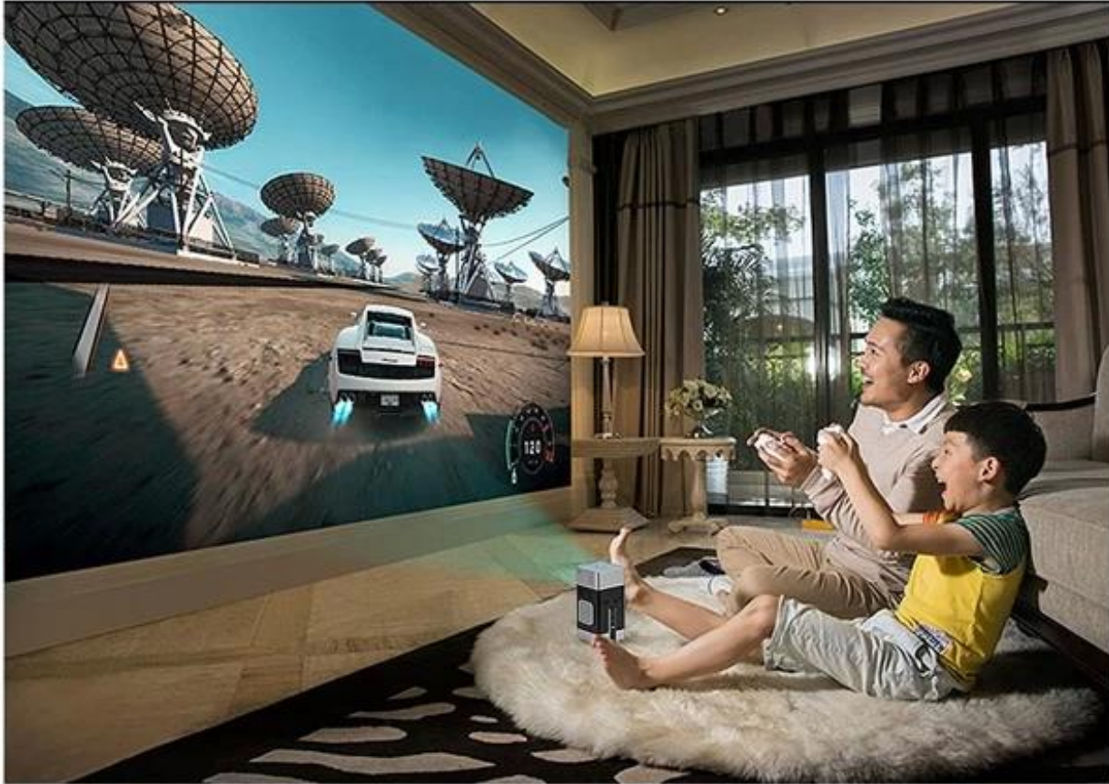
Mini DLP Projector Mobile Office

Enjoy the weekend with your family for the weekend or evening is very simple