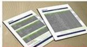
receive our quotation