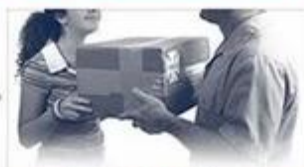
balance / delivery