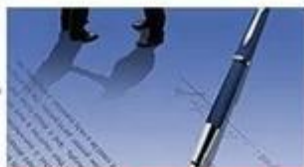
sign contract / deposit