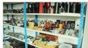
confirm the sample