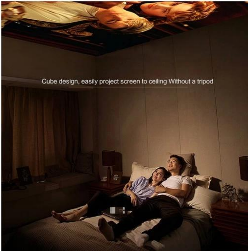
Mini video game Projector