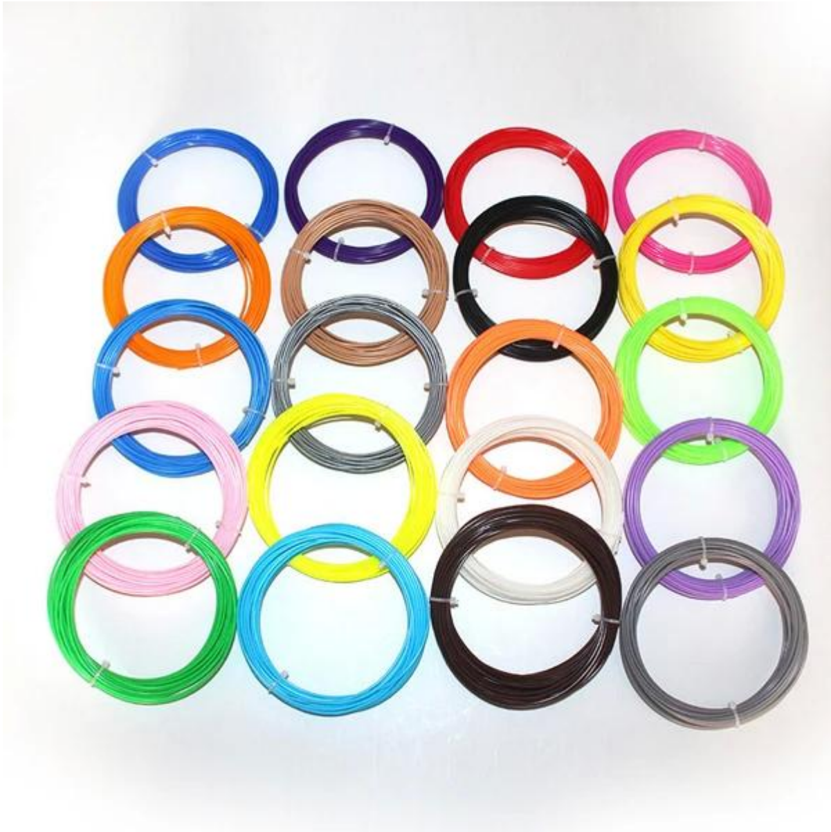
Kids creative drawing, 3D art and craft pictures