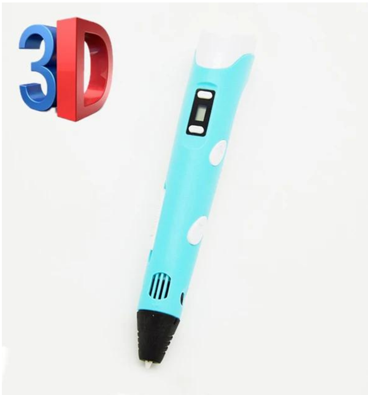
3D pen and accessories( 1x user manual, 1x3D pen holder, 1x charger adapter , 3pcs*3m Filament)