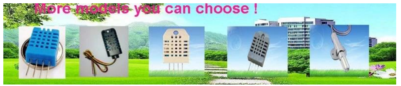
Humidity & Temperature Transmitter for Wall or Outdoor Mounting SE-MQ series