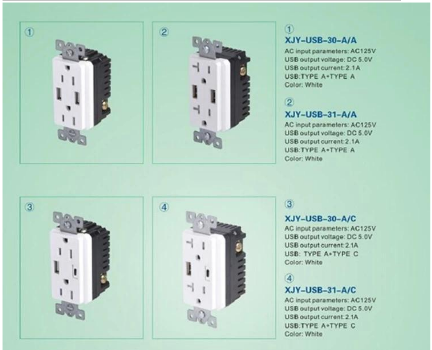
USB Wall Outlet Charger supplier