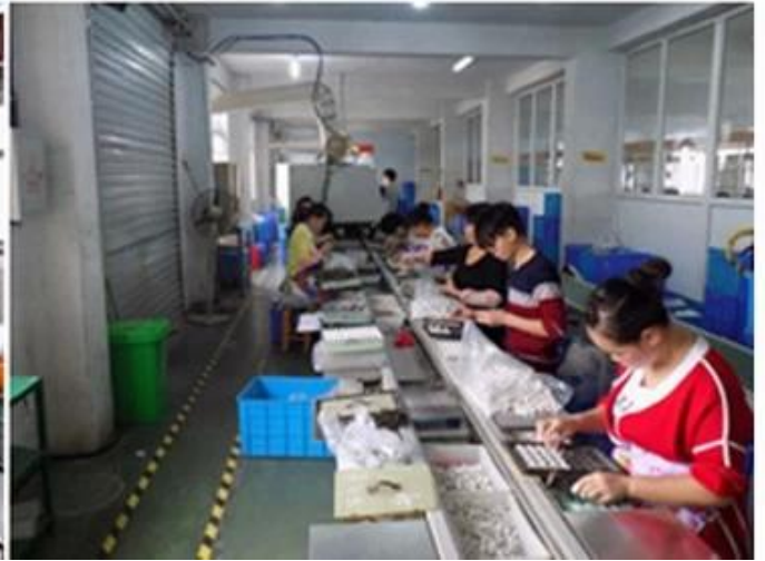
China USB Wall Outlet Charger Factory