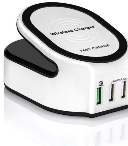
Wireless Charger Support brand: Samsung, Nokia, HTC, Google, LG, Sony, Moto