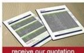
receive our quotation