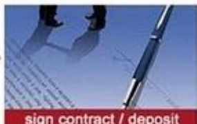
sign contract / deposit