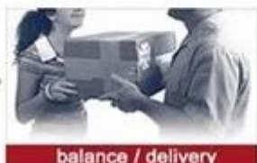
balance / delivery