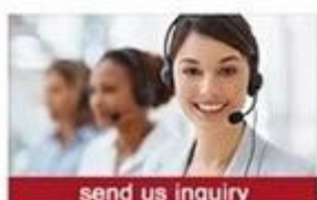
send us inquiry