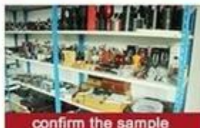
confirm the sample