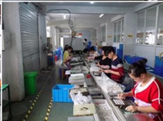
USB Wall Outlet Charger factory