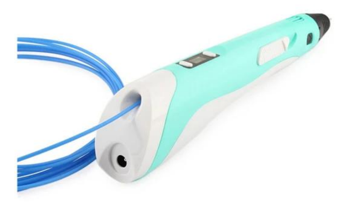
Products include 1pcs of 3D pen and these accessories