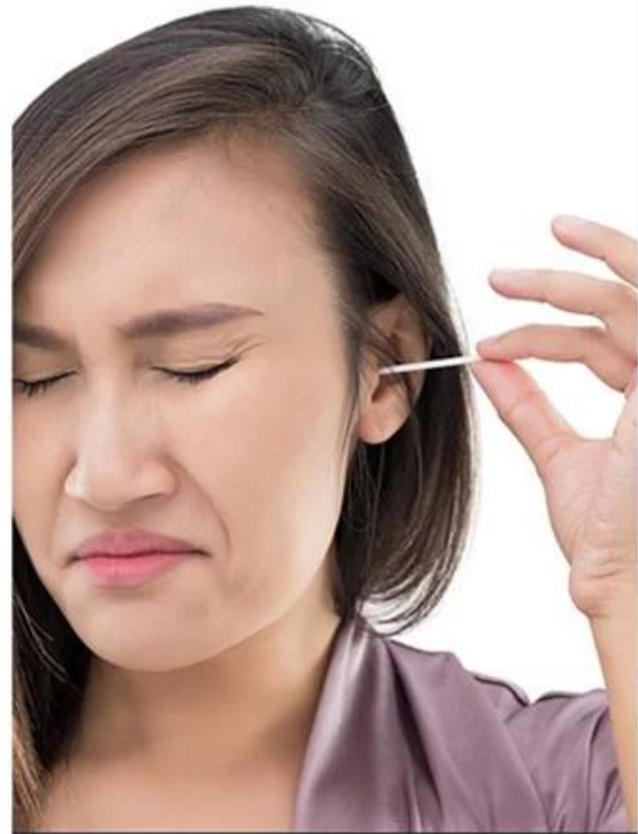
Pain in the ear