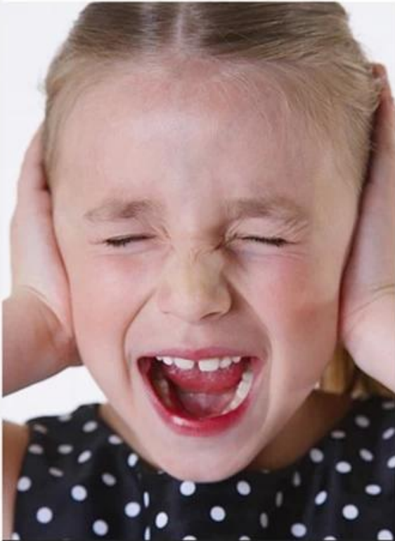
Put your ears

Through the auricle, the ear cavity, the external auditory canal What kind of courage and strength is that ear spoon